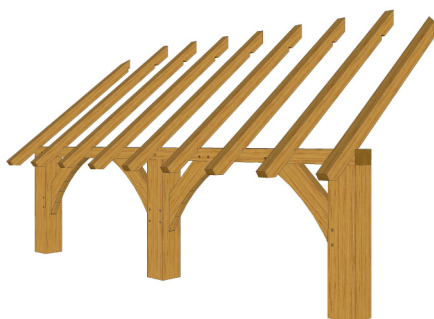
CAD DRAWING OF THE OAK KIT