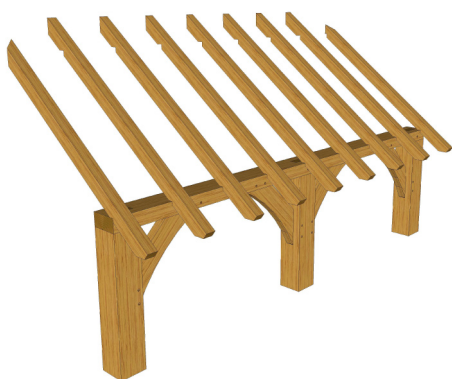
SHOWN ON A C02